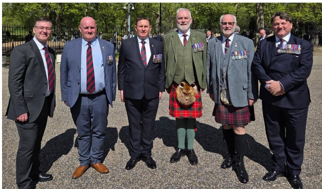
Scots Guards Dundee & Angus Branch ~ Plus