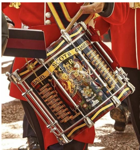
Marching to the Beat of the Drum