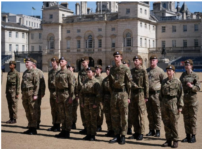
Scots Guards Cadets parade on Horse Guards Parade