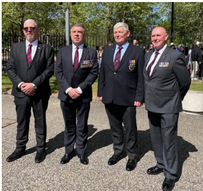
Scots Guards Association Aberdeen & North East Scotland Branch