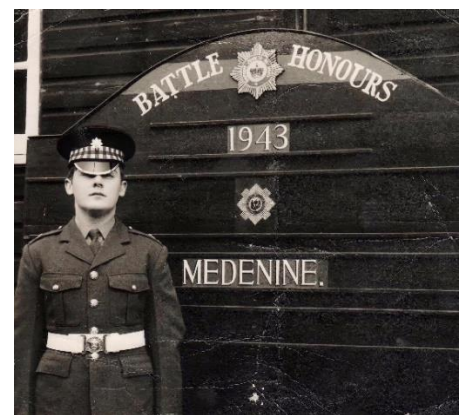
Right: A Junior Leader from the Guards Company, Oswestry in the 1960s remembers the battle of Medenine.