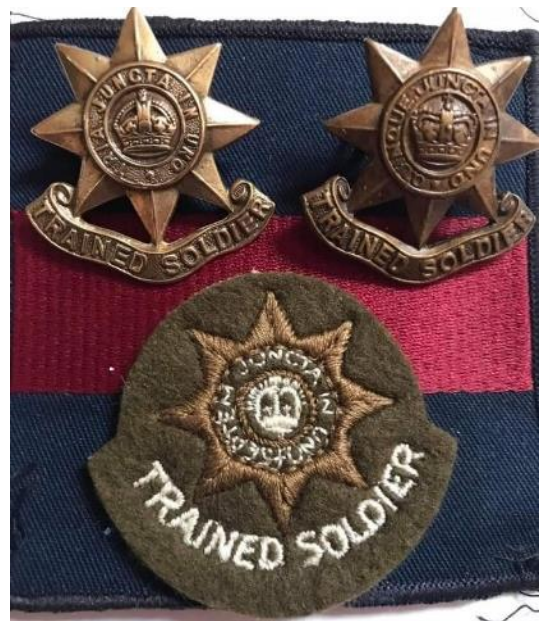
Trained Soldier @ The Guards Depot

REGIMENTAL BATTLE HONOURS THE COLOURS ARE DECKED WITH LAUREL