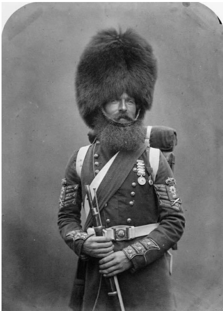
Original B&W photograph

Early March I spotted the same photograph on a book cover in Waterstones. By Ian Knight, called "Warriors in Scarlet" it's about the life & times of the last redcoats.