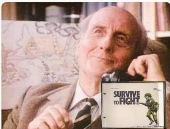
Yellow Pages ~ JR Hartley

“Do you have a copy of SURVIVE TO FIGHT by the MOD? Oh. You do? wonderful”