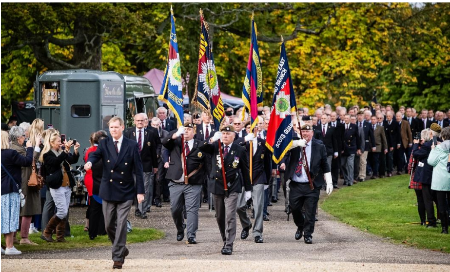
Gathering 2023 – Broomhall House