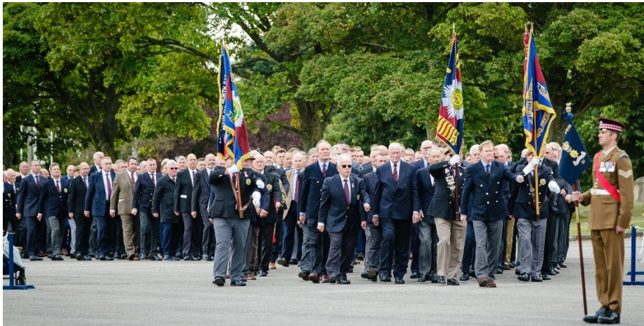
Gathering 2021 – Somme Barracks