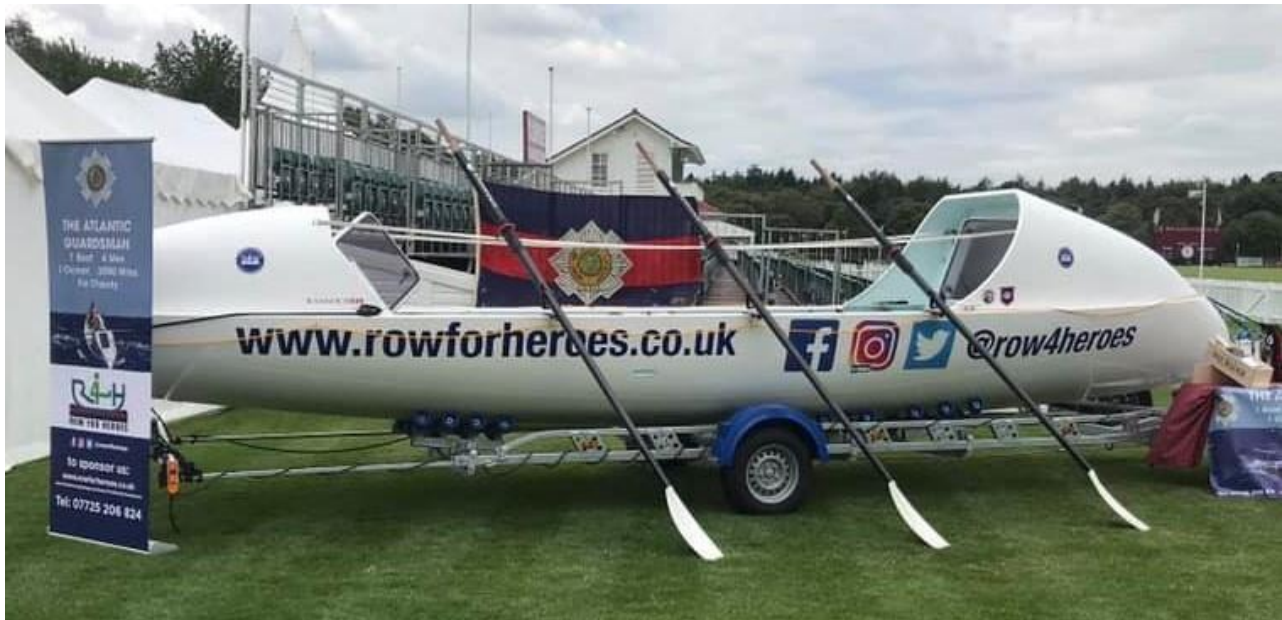
Atlantic Guardsmen - Talisker Whiskey – Atlantic Challenge