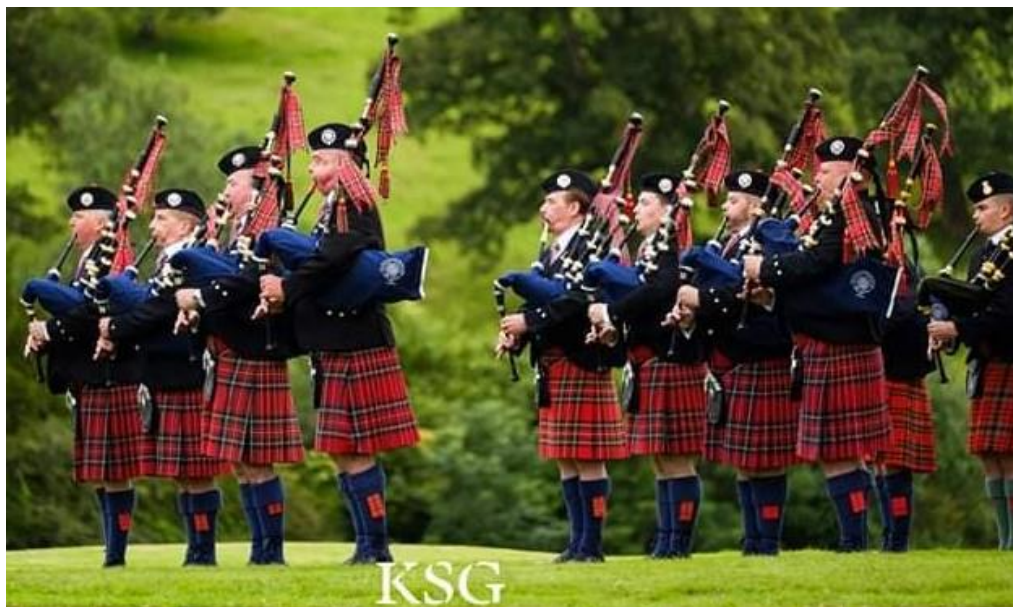
Scots Guards Association (Scotland) Pipes & Drums