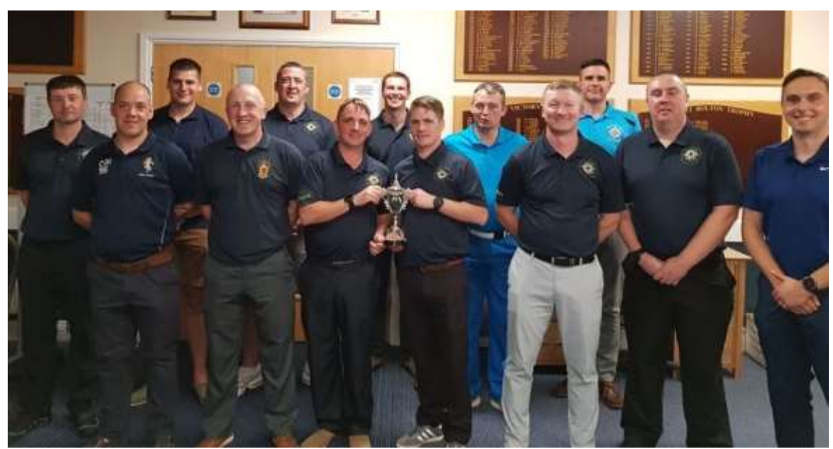
1st Battalion Golfers – Winners of the Ramsay Trophy 2020

It is hoped another match will be able to take place before the Battalion moves to Catterick and after that a competition will be developed to incorporate all Association Branches interested in competing for the Ramsay trophy annually in the south.