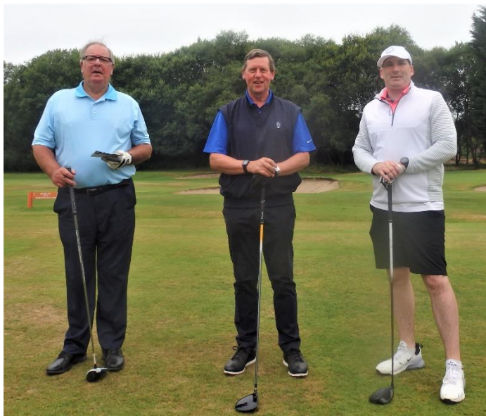
SGA Fife Golf