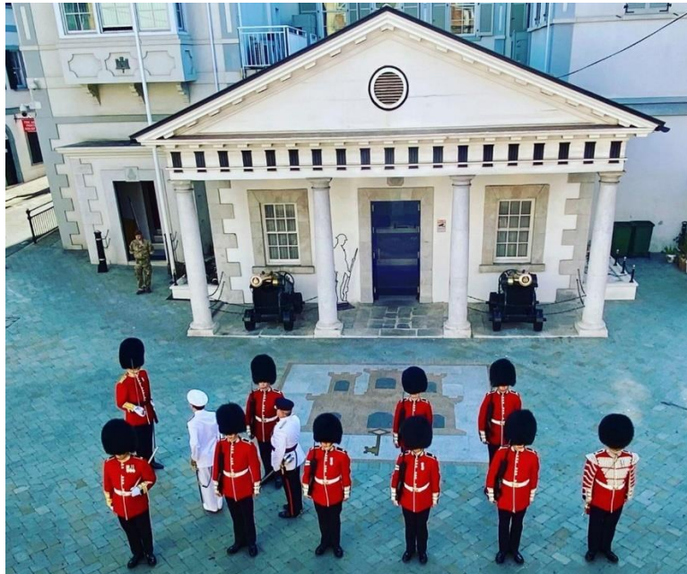
Members of F Company in Gibraltar