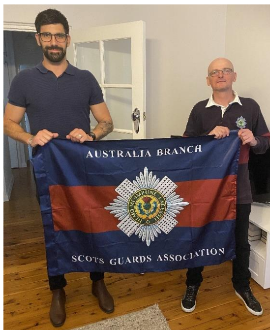
A PRE DINNER DISPLAY OF THE BRANCH STANDARD