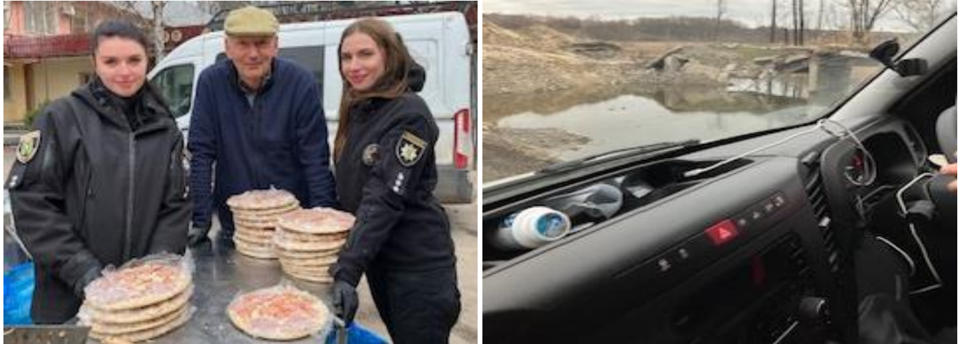
Liaising with local police

Whilst in Ukraine I met a representative who was working with a group (P4P) who are providing pickups to the Ukrainian authorities and army. I agreed that I would endeavour to raise funds to purchase one or two vehicles (and possible other key supplies) and take them out to Ukraine. This group has the contacts with the local authorities that would facilitate the smooth importation of foreign vehicles into Ukraine.