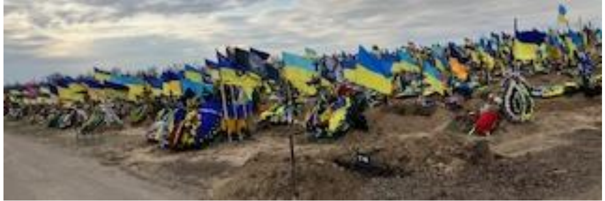
Cemetery near Kharkiv

In Ukraine I was immensely impressed with the fortitude and bravery of the people, It was also clear that there was a huge appreciation for what the British nation had already done. However, there are testing times ahead for Ukraine and indeed for the whole of western civilization. As I journeyed through Kyiv, Kharkiv and finally Zaporizhzhia there were many signs of recent battle and hardship among the villages and towns. Everywhere there were young men and women in uniform readying themselves for the battles that lie in the future. This is truly going to be an existential trial for Ukraine.