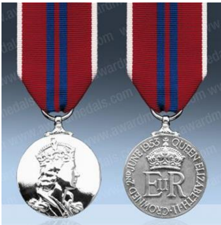
Coronation Medal 1953