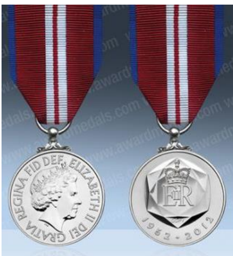
Diamond Jubilee Medal 2012