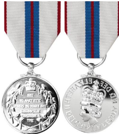
Silver Jubilee Medal 1977