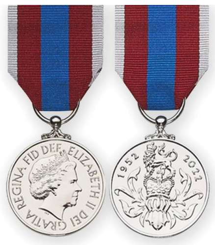
Platinum Jubilee Medal 2022