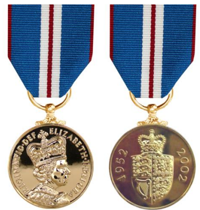
Golden Jubilee Medal 2002