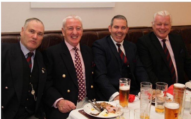
Well known Rabbits On Parade