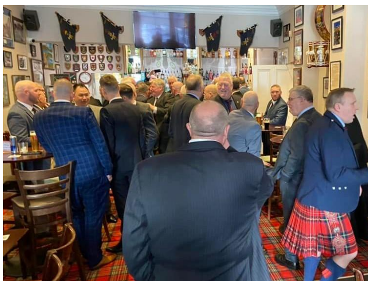
Rabbits gather at the start of the Breakfast – Calm before the storm!