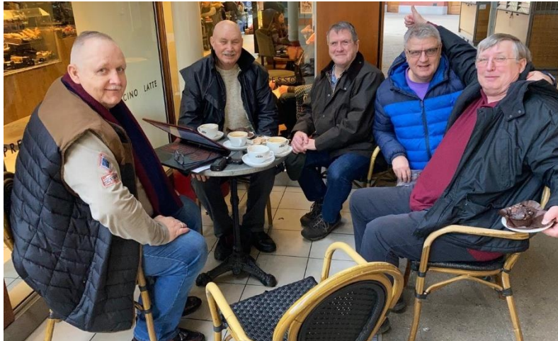
Secretaries of Southern Branches meet up for coffee & a natter in Windsor

The Branch will hold its AGM at Datchet Golf Club on Friday 25th March 2022, 1930hrs for 2000hrs.