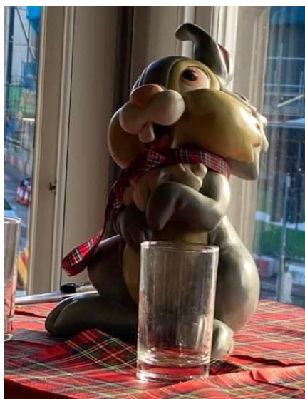
A Rabbits – Toast