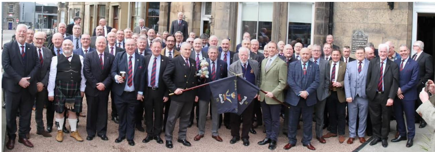
Rabbits On Parade