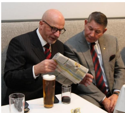
Rabbits catching up on the news