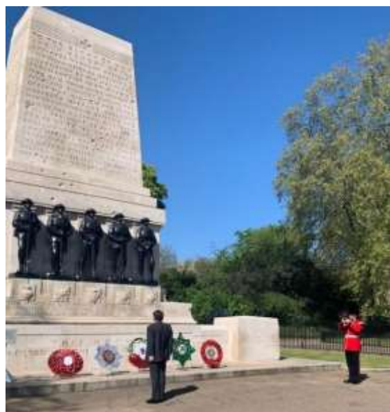
Regt Adjt lays a wreath at the Guards Memorial.