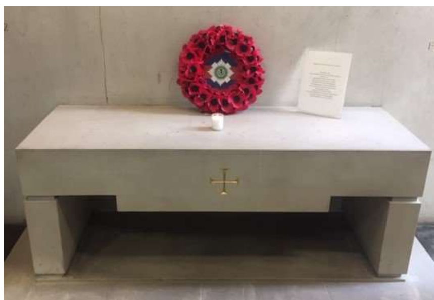
A Regt Poppy wreath laid in the Guards Chapel.