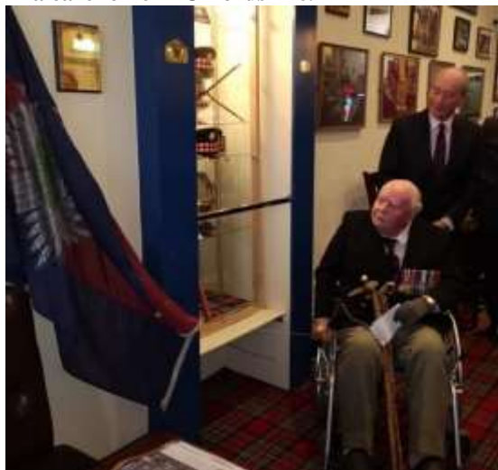
Lord Elgin was wounded serving with 3SG at Caumont