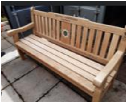
The Memorial Bench

On Friday 6 May 2022 those attending the memorial bench unveiling are invited to gather together at The Station Hotel, Perth. If you want to stay overnight email the hotel, <u>events@perthstationhotel.co.uk</u> quote memorial and they will book you in as part of the group.