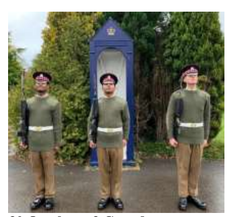
30 October - 3 Guardsmen Pass Out.