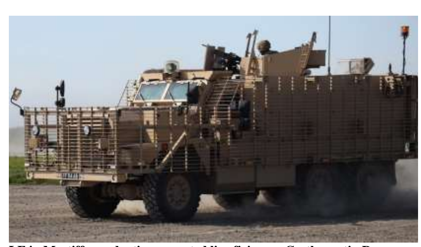
LF in Mastiffs conducting mounted live firing on Castlemartin Ranges.