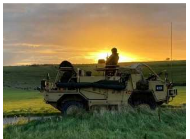
The Recce Pltn head out for the night in preparation for a company attack.