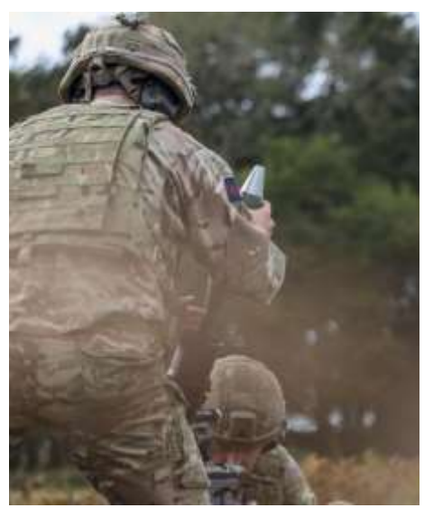
The Mortars hone their skills, part of their Mission Ready Training.