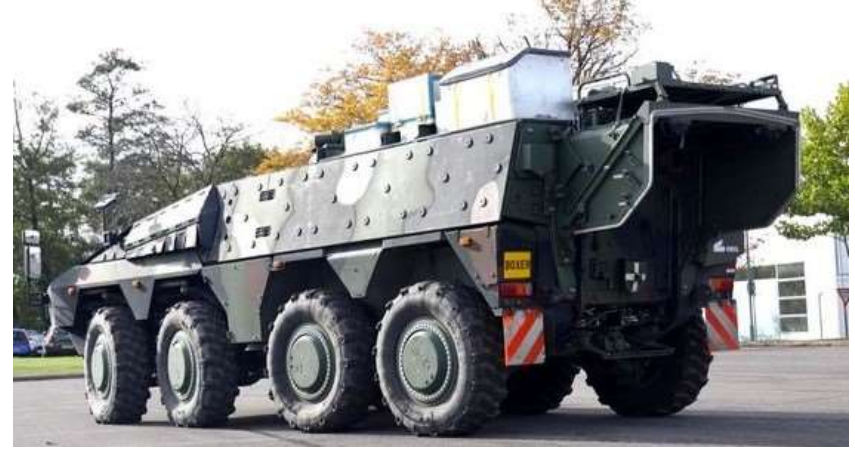
A chance for the Bn to check out Boxer at Mons Barracks, Aldershot