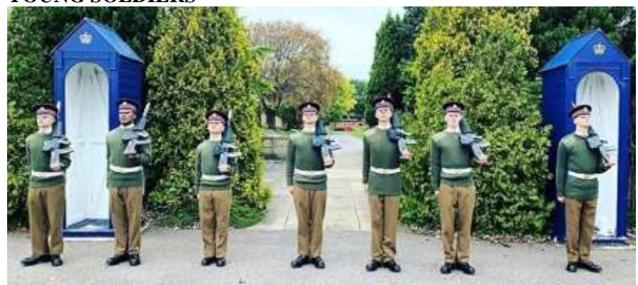
16 October - 7 Guardsmen Pass Out from Gds Coy, ITC Catterick