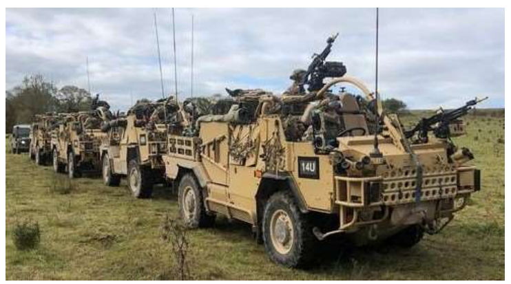
The Machine Gun Pltn conduct Battle Preparation before providing fire support for a company attack on Imber Village.