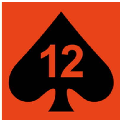
Off with the Old

1 Armd Inf Bde HQ will remain at Tidworth forming part of a Reaction Force as a Strike Bde.