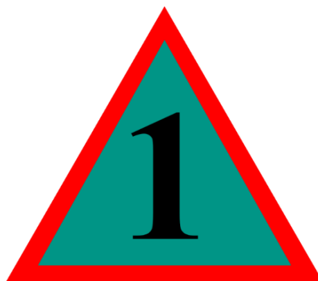
On with the New

Men from C Company are in Belize on exercise with Grenadier Guards. They have been getting to grips with living in the jungle, from learning to navigate to acclimatisation PT in temperatures up to 35 degrees and 90% humidity to practising hammock construction.