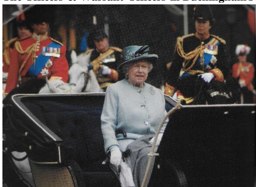
Queen's Birthday Parade ~ 1SG Escort 2011