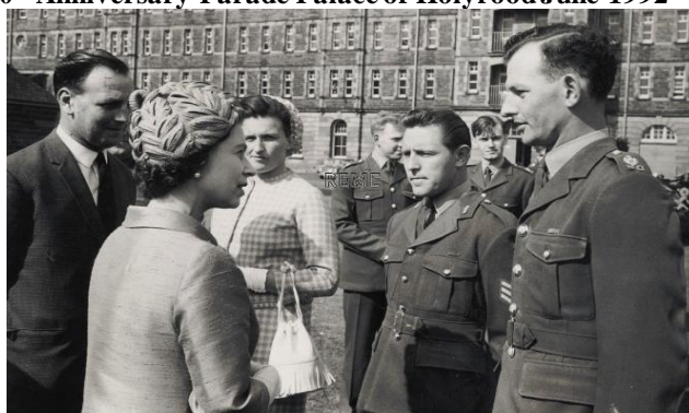
1SG Garden Party Redford Barracks, Edinburgh July 1968