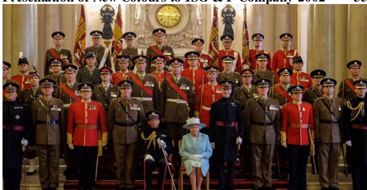
The Officers & Warrant Officers in Buckingham Palace 2017