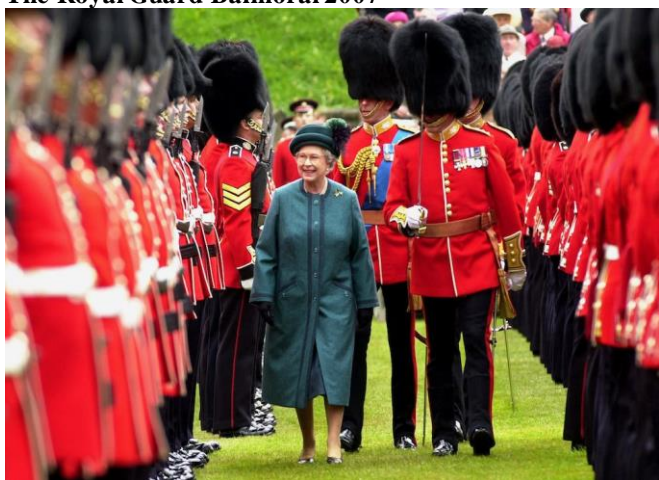
Presentation of New Colours to 1SG & F Company 2002