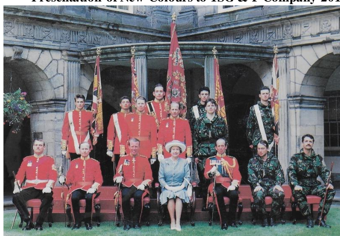
350 th Anniversary Parade Palace of Holyrood June 1992