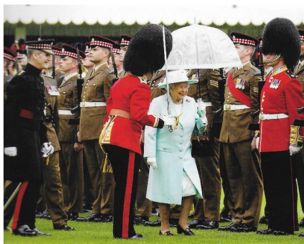
Presentation of New Colours to 1SG & F Company 2017