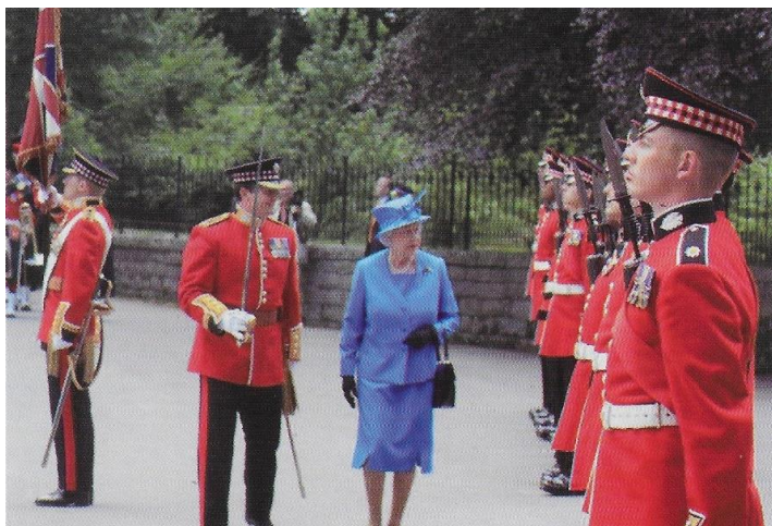
The Royal Guard Balmoral 2007