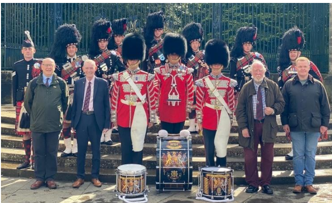
Thursday 14 Sept ~ The Glen Gates, Dunfermline