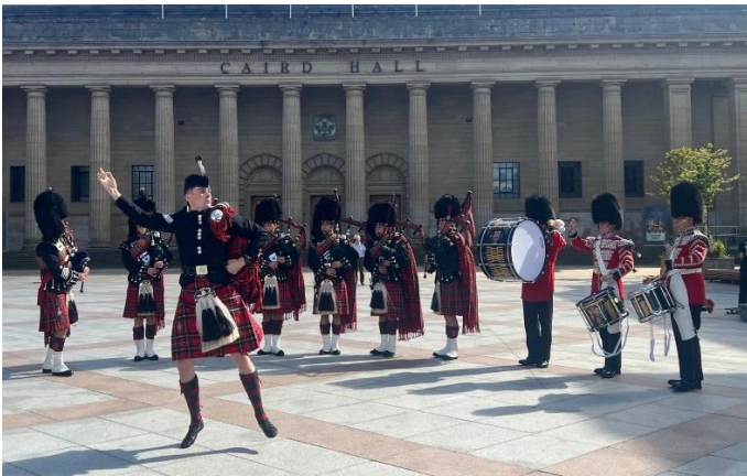
Monday 11 Sept ~ City Square, Dundee