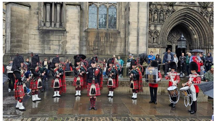
Friday 15 Sept ~ St Giles Cathedral, Edinburgh

If you’re wondering if they had a rest day on Wednesday 13 September ~ No they were playing for a military veterans group.