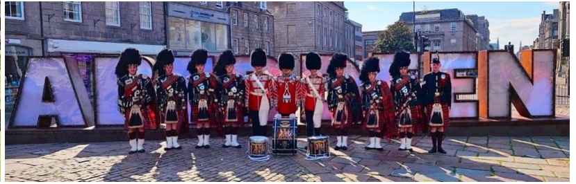
Sunday 10 Sept ~ Aberdeen