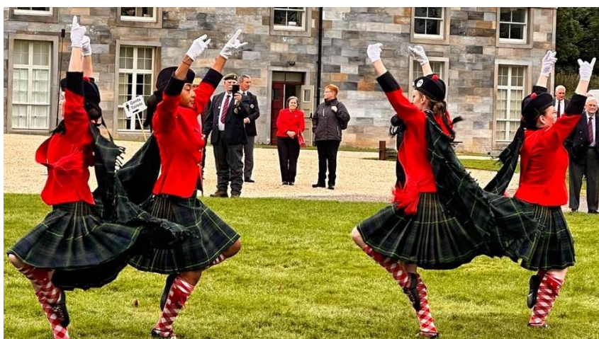
The Dancers of Queen Victoria School, Dunblane