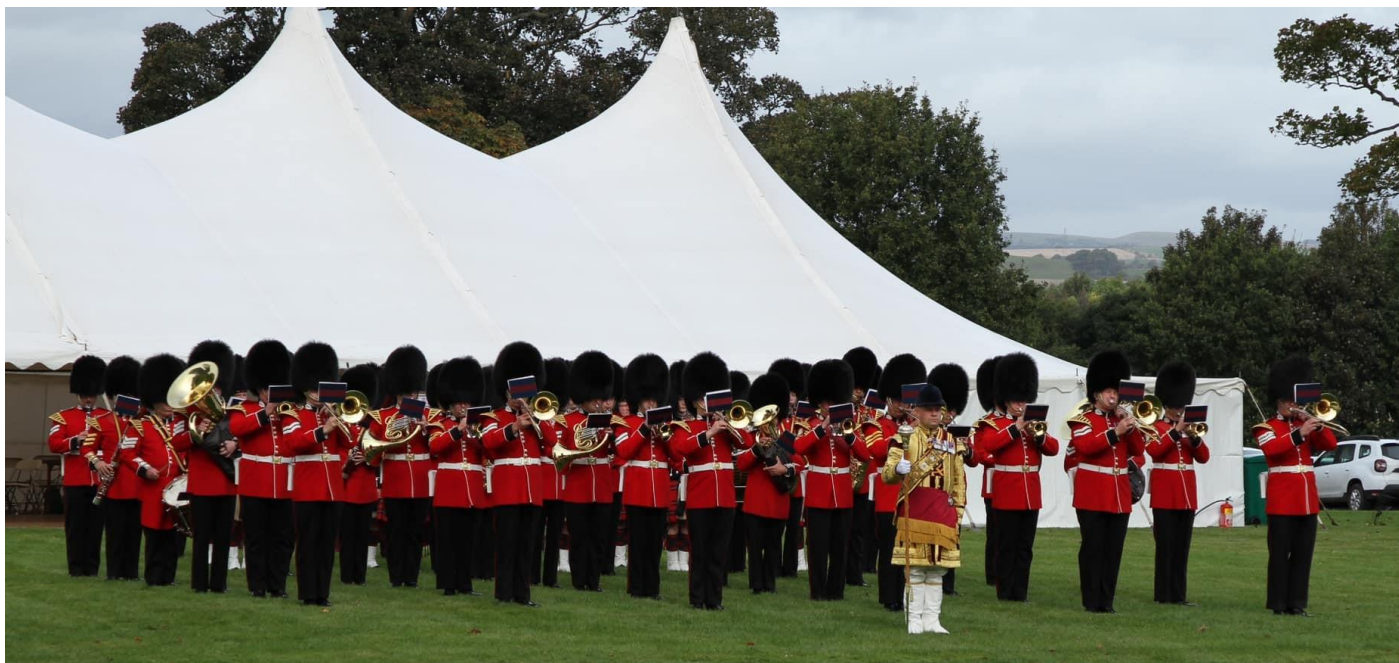
Band of the Scots Guards & a Mammoth Marquee