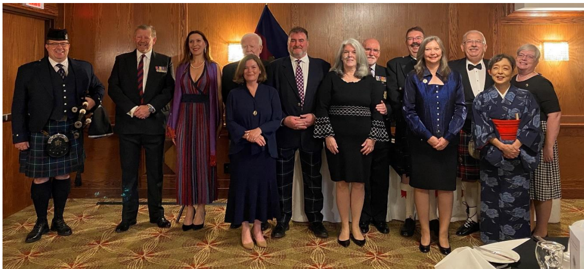
Scots Guards Association ~ North America Branch & their ladies

The association on the other side of the pond is strong, but many are now in their senior years, it is hard for them to travel but you can be assured their hearts and minds are that of Scots Guardsmen.