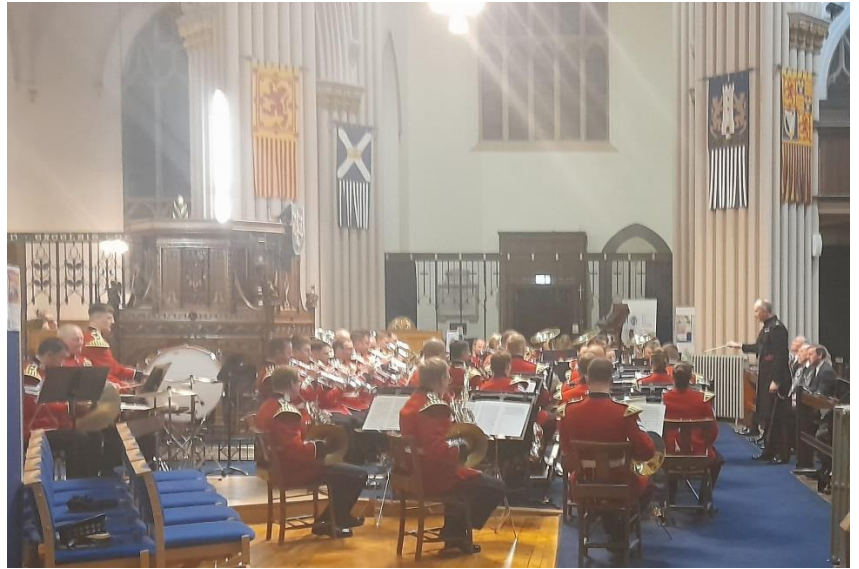
Right: The Band of the Scots Guards plays to a packed house at Dunfermline Abbey.