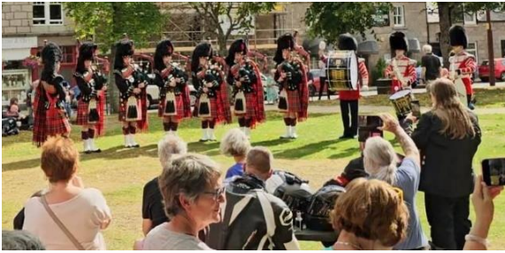
Saturday 9 Sept ~ Ballater

Between Saturday 9 & Friday 15 September 2023 in the 1 st Anniversary week on the Late Queen’s death the 1 st Battalion Pipes and Drums followed the route of her final journey from Ballater to St Giles Cathedral, Edinburgh.