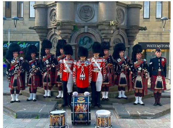
Tuesday 12 Sept ~ Perth