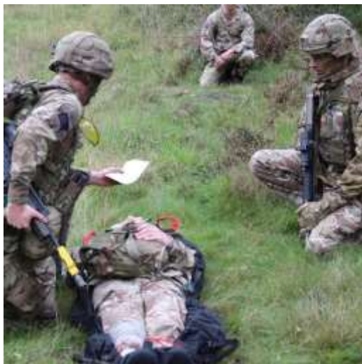
Right Flank Section Patrol Competition when junior leaders were put through their paces, The Gdsm were tested on the specialist skills they have recently practiced.