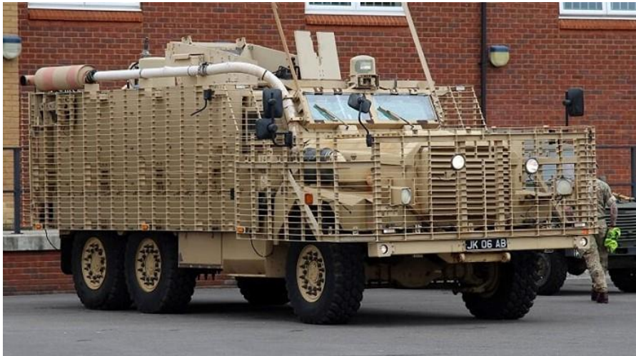
Good Bye Mastiff.

As a Protected Mobility unit, the 1 st Battalion use the Mastiff vehicle to transport themselves around the battlefield.