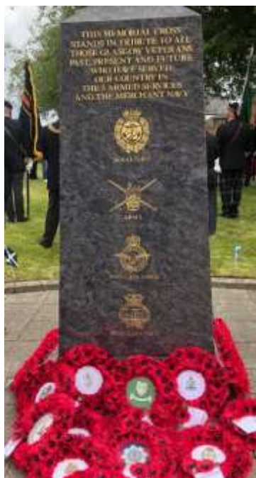
Knightwood Services Memorial