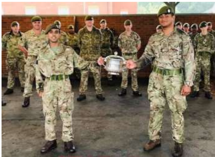
Well Done Left Flank

Congratulations go to Left Flank the winners of the 2020 Gipps trophy.