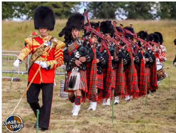
Clash of The Clans

1 st Battalion Scots Guards Pipes & Drums are set to play a full & spectacular part in the Regimental Gathering.