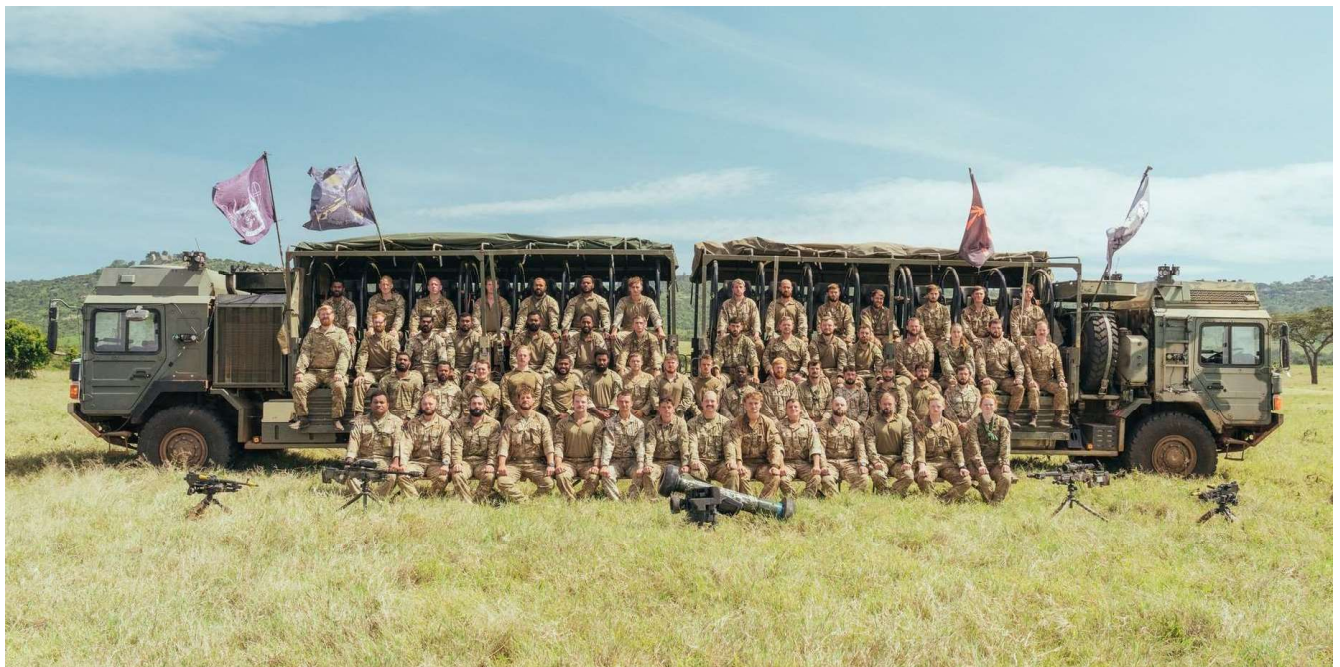
Scots Guards training in Kenya