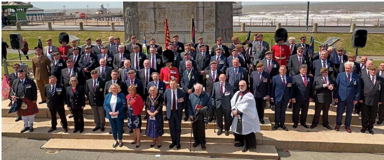
Scots Guards Past and Present gather to remember those that lost their lives in the Falkland Islands during the Battle of Mount Tumbledown.