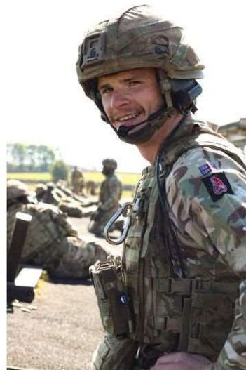
Scots Guards rehearsing their shooting skills

We aim to grow our investments by £4M over the next 5 years for the Scots Guards Charity. Why? The Fund is concerned that given the current and ongoing military commitments, the Regiment won't have enough income to continue to support serving and former Scots Guardsmen and their families which, in our view, is of paramount importance. In the last year we made 63 individual welfare grants.