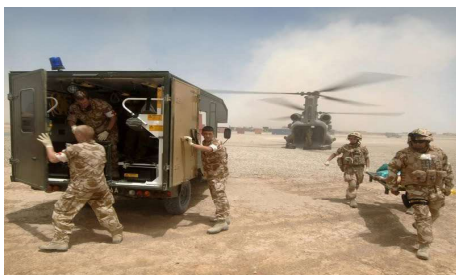
Wounded Soldier receives lifesaving treatment whilst being evacuated by helicopter.

Our charity gives out financial support based on income generated from investments. Having reviewed our needs, we have been working to raise the profile and add £4M to this investment pot in order to secure the legacy for future generations of the Scots Guards family. A few examples of our work are as follows: